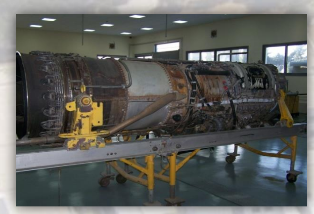
Propulsion Systems Laboratory