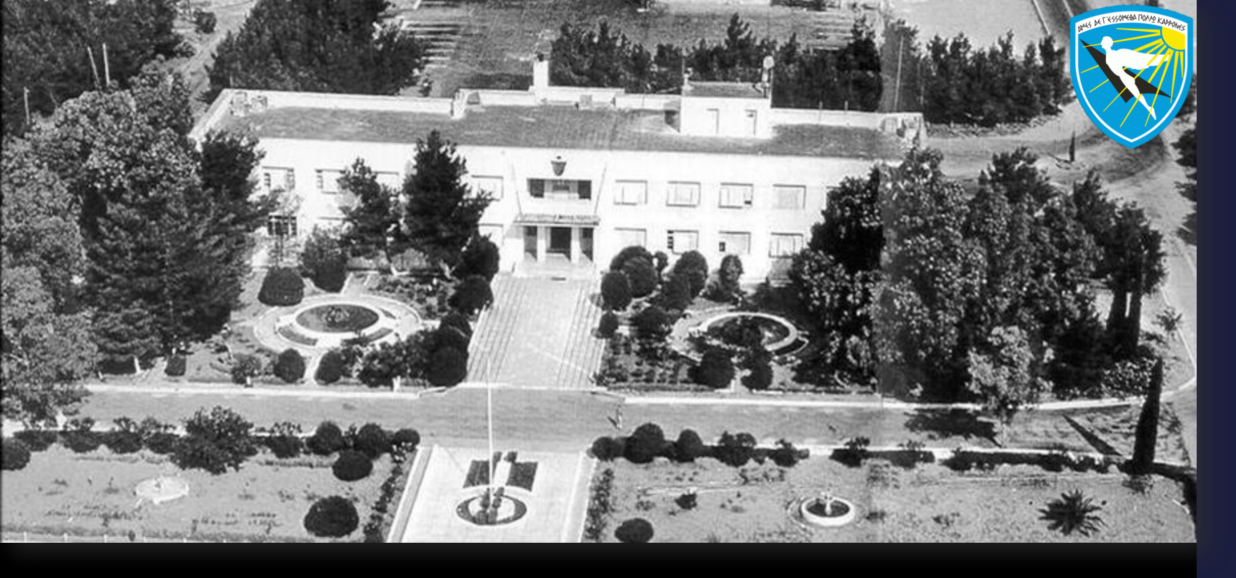
Hellenic Air Force Academy