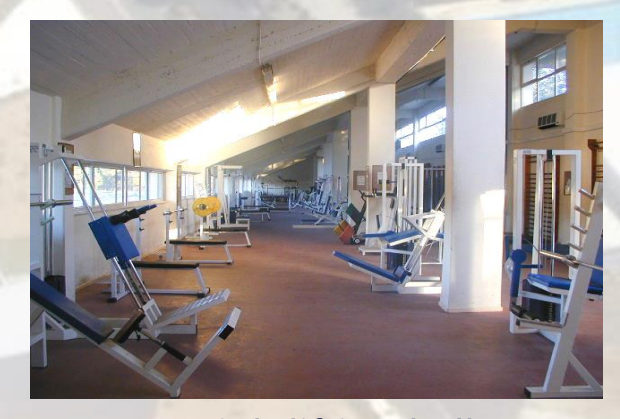
Weigh lifting hall