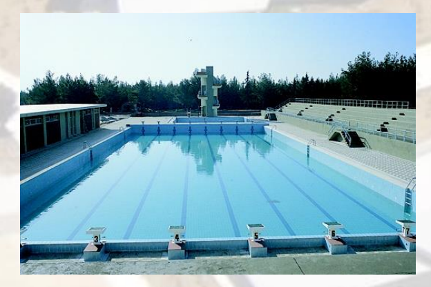
Outdoor swimming pool