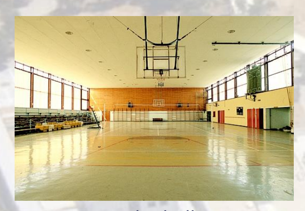
Basketball/ Volleyball court