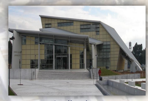
Auditorium "Lt. Nikolaos Sialmas"